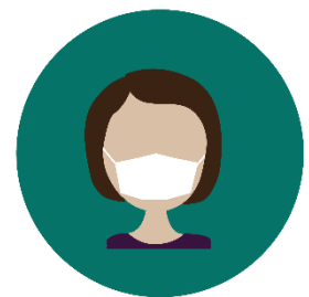
Wear face coverings