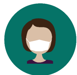
Wear face coverings